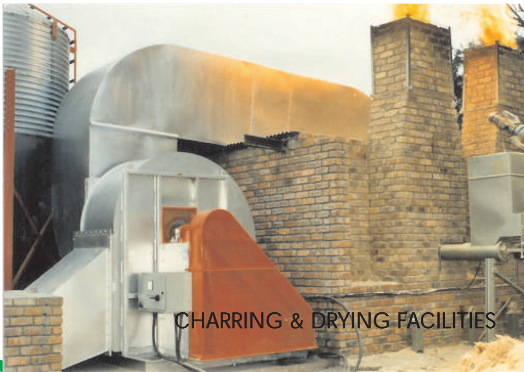
CHARRING & DRYING FACILITIES

Tel / Fax: +27 18 431 1287 / 431 0555 E-mail: goafrika@lantic.net Web: www.gentag.co.za